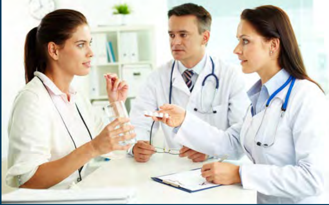
Exhibit at NeoHeart 2020- VIRTUAL EXHIBIT HALL Reach Decision Makers