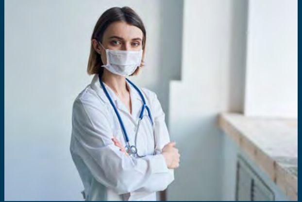
EXHIBIT OPPORTUNITIES OCT 28, 29, 30, 2020 IN VIRTUAL EXHIBIT HALL