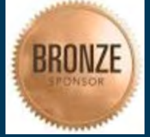
Exhibit only: $5,000 USD